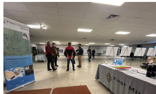
Ear Falls - January 22