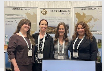
The First Mining Gold PDAC 2025 booth.

Since it began in 1932, the convention has grown in size, stature and influence. Today, it is the event of choice for the world's mineral industry, hosting more than 1,100 exhibitors and 700 presenters. First Mining Gold was pleased to participate in the annual conference this year as an exhibitor, as well as showcasing both the Springpole Gold Project and Duparquet Project in the Core Shack.