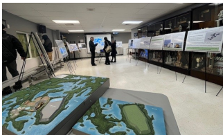
Sioux Lookout - January 21

In late January, First Mining Gold was honoured to spend time in the municipalities of Sioux Lookout, Ear Falls, and Red Lake sharing information on the Springpole Gold Project. Public information sessions were a combination of formal presentations and drop-in style meetings with display materials detailing the Environmental Assessment process. These sessions provided an opportunity to share the findings of the final Environmental Assessment submission and answer any questions from the public. The Springpole Gold Project involves the construction, operation and decommissioning/closure of an open pit gold and silver mine.