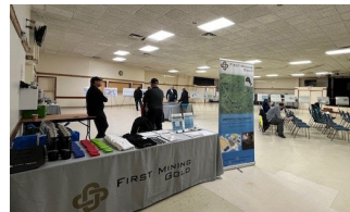
Red Lake - January 23